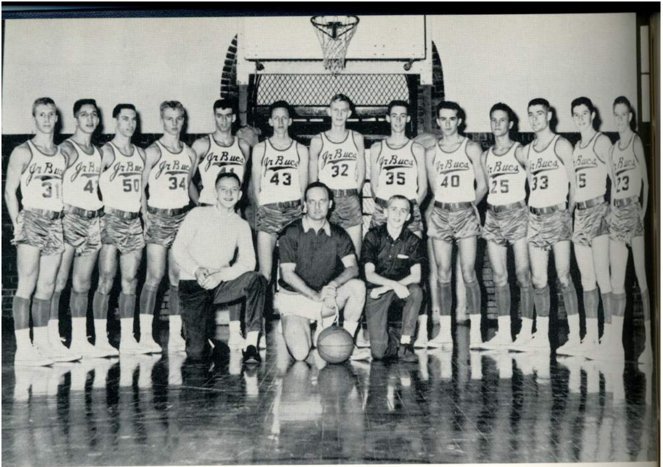
1961-62 Jr. Buc Varsity