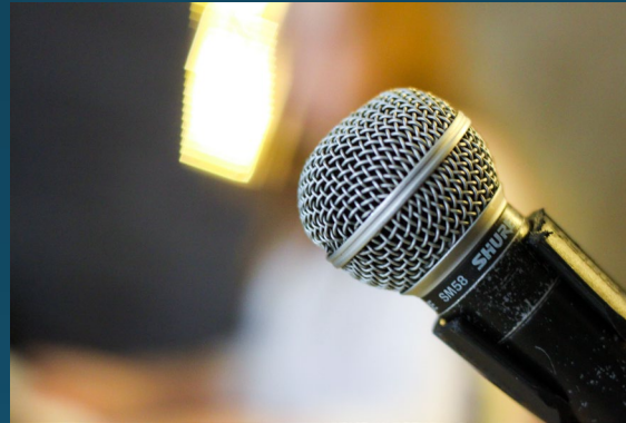
Communicate internally: Teaching @ ETSU