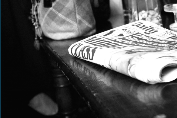
Communicate with public: Teaching @ ETSU