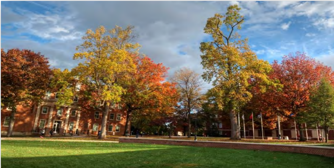
The Quad in early fall.