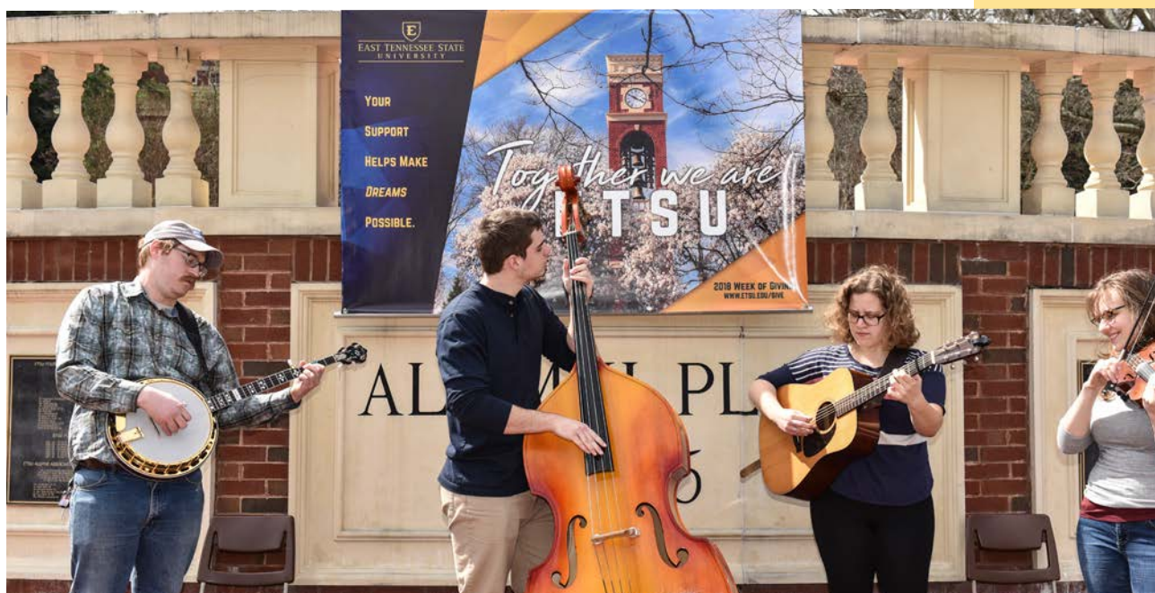
ETSU Bluegrass Band playing during a Week of Giving Event on March 15, 2018.

President/CEO & Vice President for ETSU Advancement