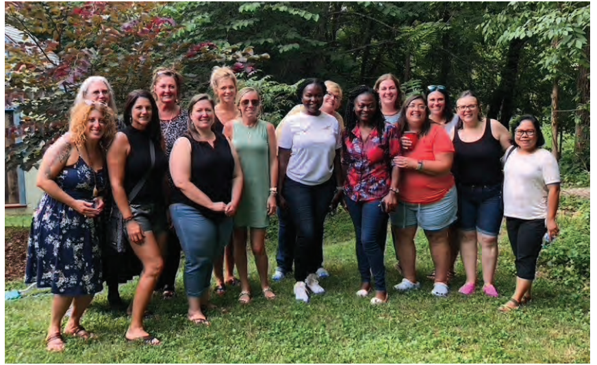
Students from the 2019, 2020, 2022, 2023 PhD cohorts at a social gathering during the summer 2023 on-campus weekend.