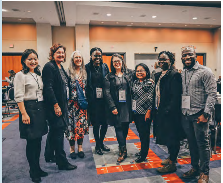
ETSU Early Childhood PhD Faculty, students and graduates attending the National Association of Early Childhood Teacher Educators (NAECTE) Conference in Washington, D.C.