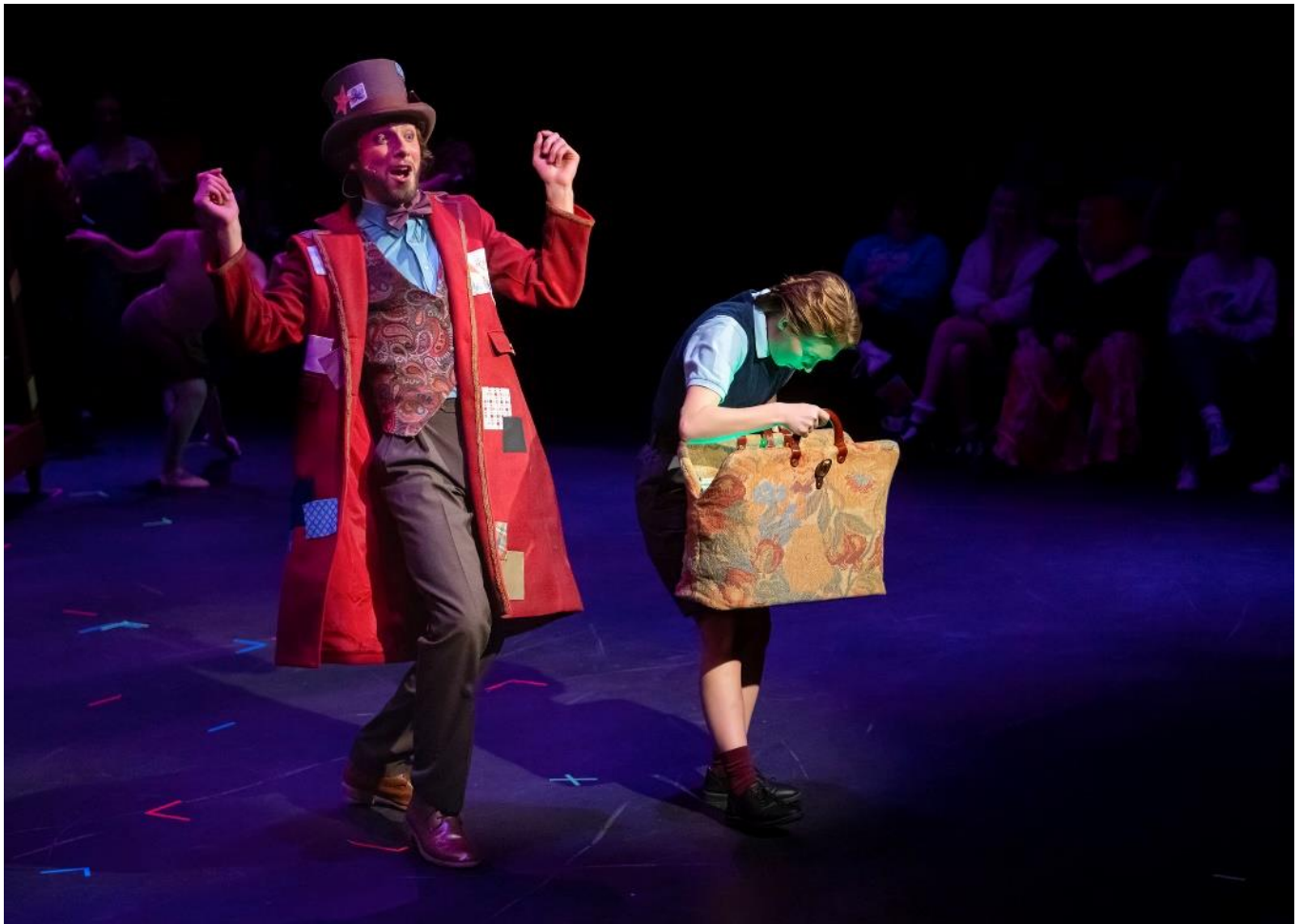
James and the Giant Peach Fall 2023

Advanced production roles are assigned late in the spring semester for the following academic year. Completed applications are due by the end of Friday prior to spring break and can be accessed here: https://forms.office.com/r/4nE46k5equ . You may be asked to log in with your ETSU credentials.