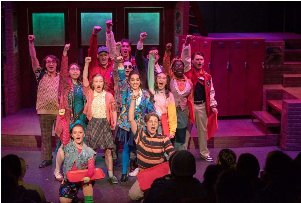
Heathers spring 2024