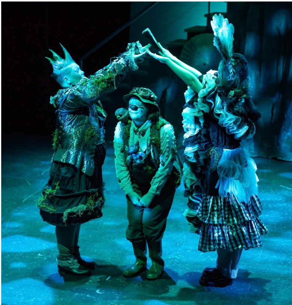
Eurydice Spring 2024