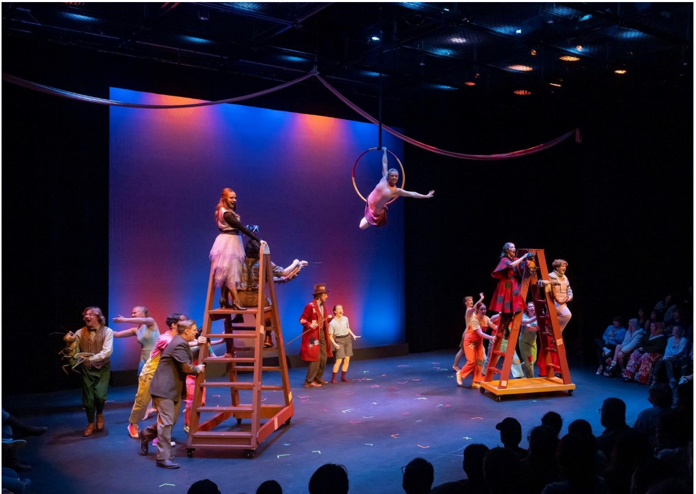
James and the Giant Peach Fall 2023