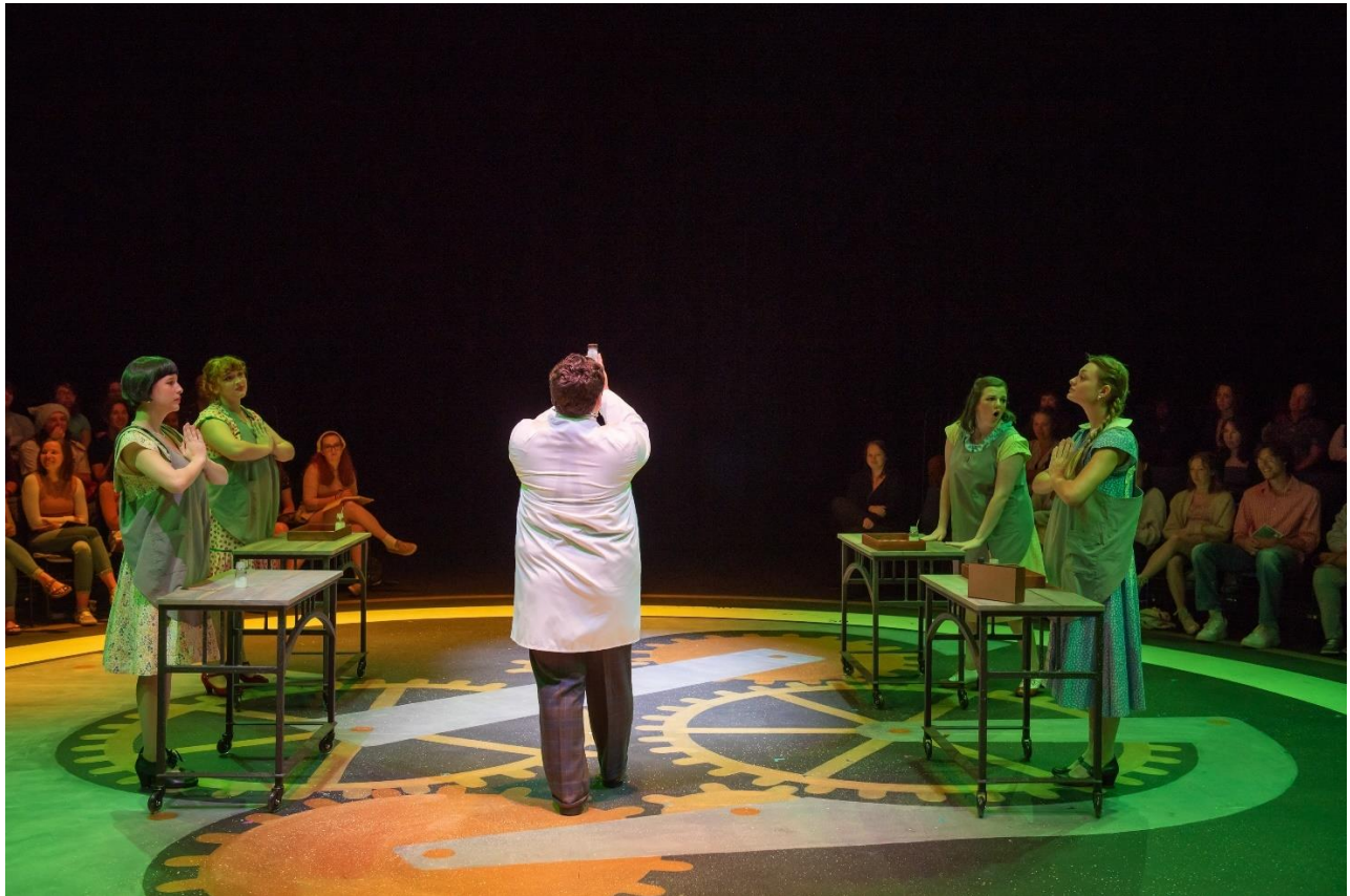
These Shining Lives Fall 2023