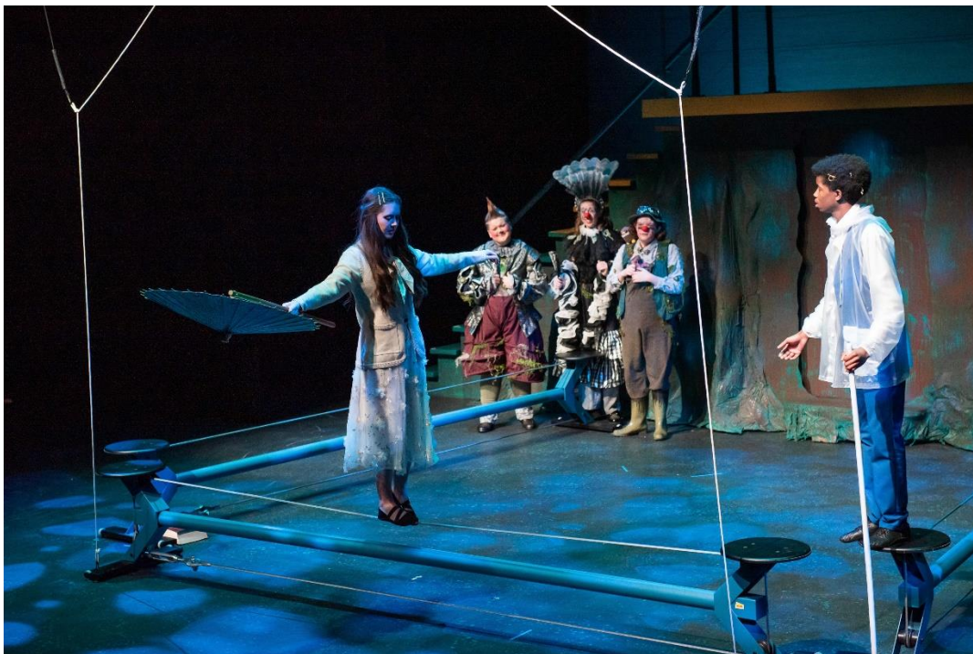
Eurydice Spring 2024