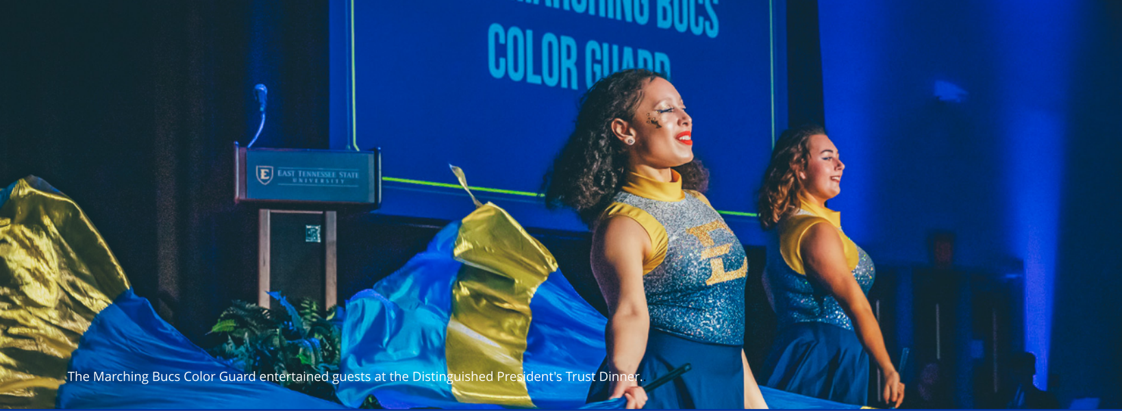
The Marching Bucs Color Guard entertained guests at the Distinguished President's Trust Dinner.