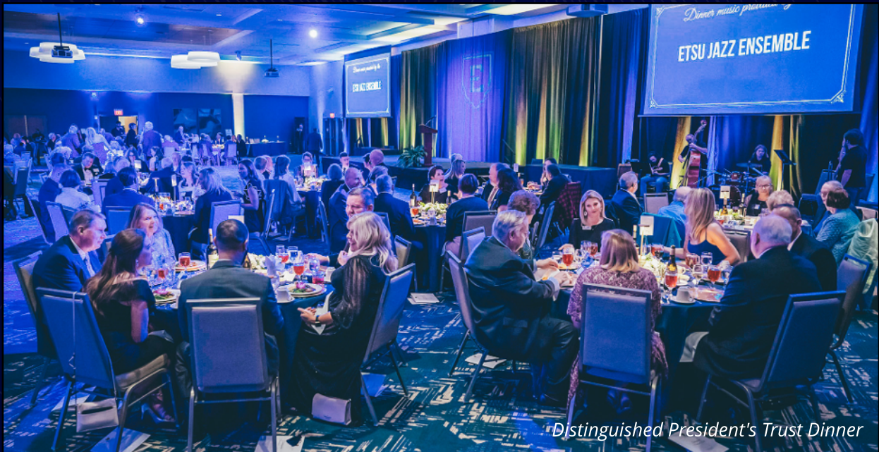
Distinguished President's Trust Dinner